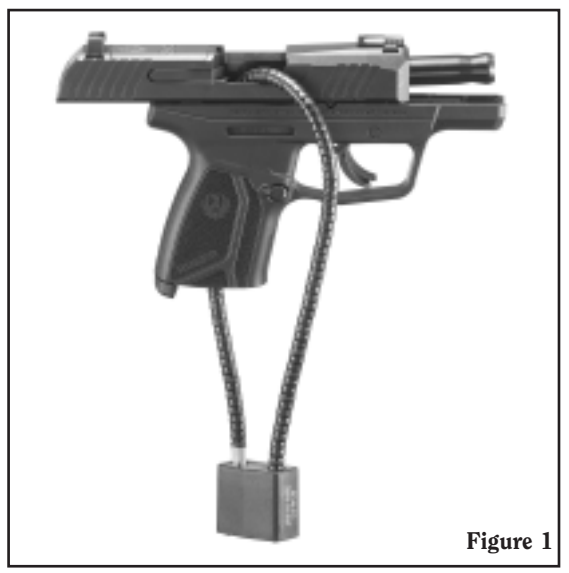
Correct installation of the lock on a Ruger<sup>®</sup> MAX-9<sup>™</sup> pistol.